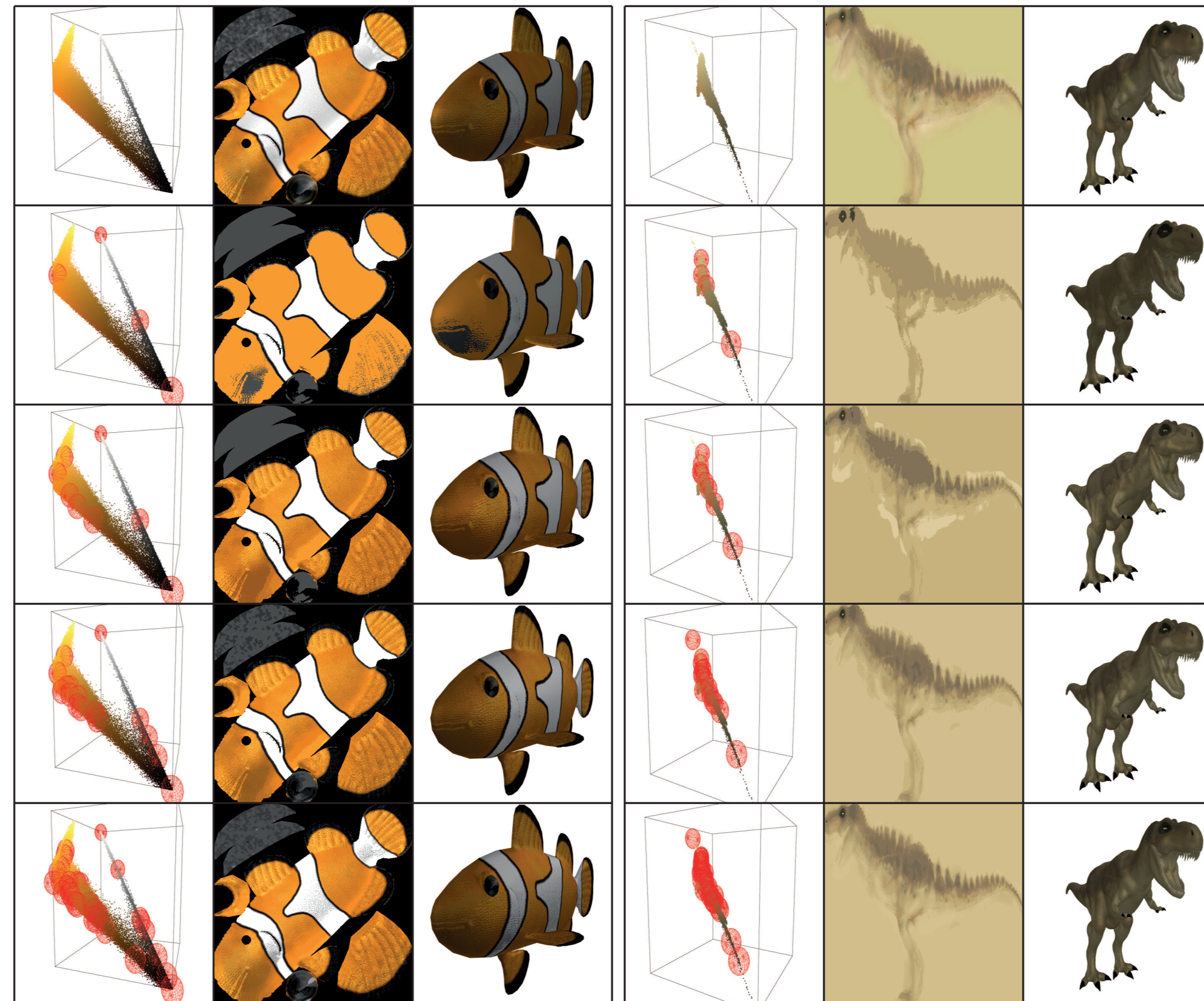
FIGURE 1: Texture-object model space segmentation on the fish and the tyrannosaurus model for 4,8,16,32 colors.

We propose to use the hierarchical clustering algorithm [HTF09] to produce dynamic segmentations (we have also implemented a k -means segmentation, but results show that hierarchical clustering gives better solution while avoiding creation of new colors) : we search among the set of n colors, each pair of spatially closest ones. Each pair is merged into a new color. All configurations are saved and the process is reiterated until convergence (only when one single color remains). The entire process is realized offline and we store the colors computed at each iteration in a line of a 2D texture. This texture describes a colors tree where we can search for the closest color at any level or find it using an incremental algorithm. Finally, we render the model : a GPU shader is used to colorize each fragment using the texture previously generated according to the texture coordinates and the initial texture. An uniform value l , expressing the desired level of abstraction, is given as an input of our shader. This value is used as the t coordinate of the generated texture. Therefore texturing each fragment of the mesh consists in finding, for this fragment and in the generated texture, the closest color to the one used in the initial texture : for a given line ( t ) in the generated texture (containing the set of segmented textures colors), the closest color ( s ) to the initial one.