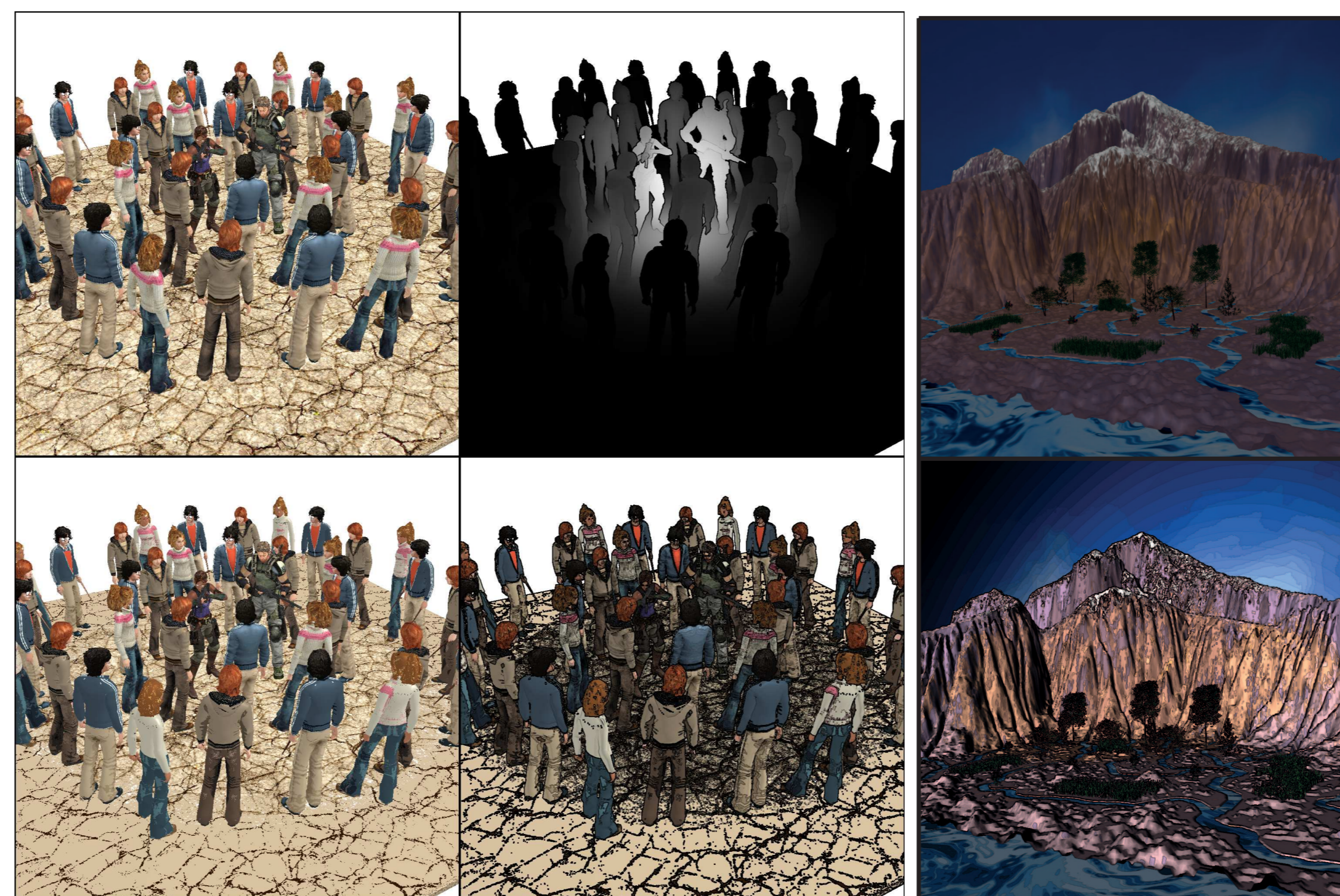
FIGURE 2: On the top left, the original 3D scene is presented.

The last ones show the differences in results depending on the number of colors used.